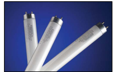
GTI lamps are manufactured with proprietary fluorescent phosphors that are unequalled by any other lamp in the industry. They produce a true full spectrum white light which renders colors with the highest degree of accuracy, color rendering, and efficiency.