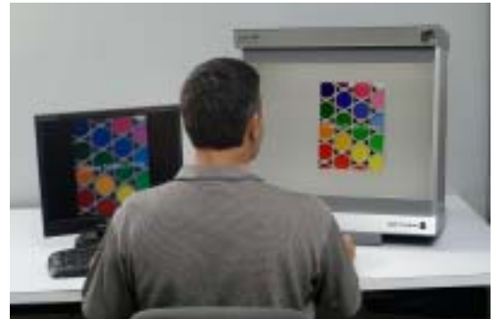
Soft View Model SOFV-1xi is the ideal viewer for color critical soft proofing applications.

The SOFV-1xi includes a number of innovative design elements including adjustable light shields for both upper and lower luminaires to enable you to optimize the viewing experience, a steel viewing surface to allow the use of magnets (included with unit) to precisely position artwork, and easy access controls mounted on the front panel.